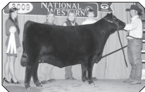
MCCURRY BLACKCAP 7028 - Reserve Junior Champion Female at the 2008 National Western Stock Show whose dam is a maternal sister to the dam of Lot 2.