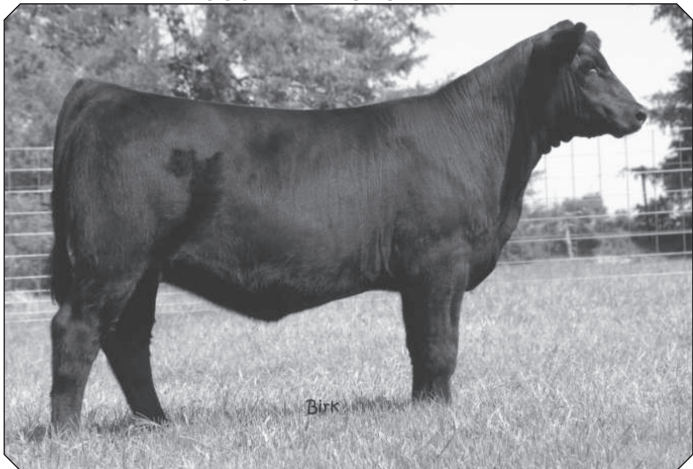
MCCURRY BLACKCAP 9024 – She sells as Lot 2.