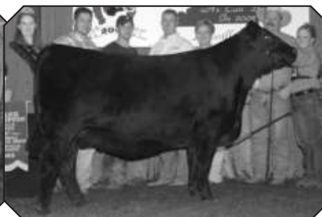
MARANDS ROYAL LADY 1037 - The 2003 National Junior Angus Show Grand Champion Owned Female and the 2003 Western National Junior Angus Futurity Reserve Grand Champion Owned Female.