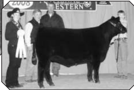
MCCURRY BLACKCAP 7028 - The Reserve Spring Heifer Calf Champion of the 2008 National Western Junior Angus Show and the 2009 Reserve Junior Champion Heifer at the National Western Stock Show.