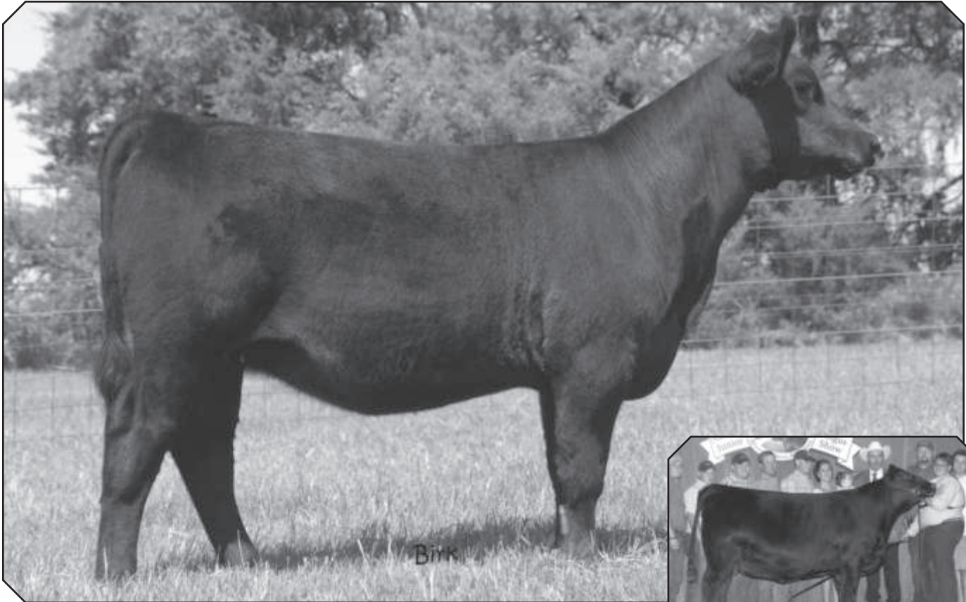
MCCURRY SUSANNA 9004 – She sells as Lot 15.