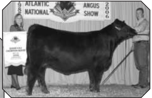
MARANDS MISS WIX 4059 - The 2006 Senior Heifer Calf Champion at the Atlantic National ROV Show.