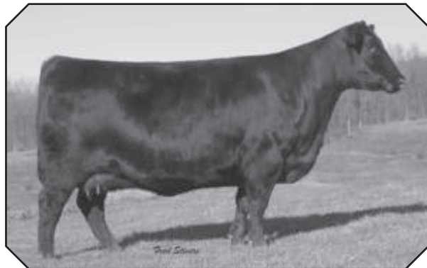
SAV ELBA 7099 – Fourth generation dam of Lot 1.