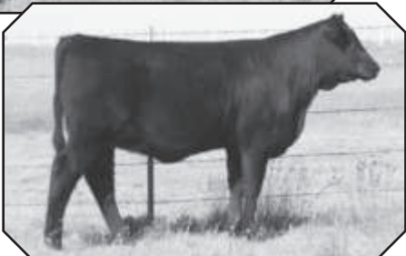
KTP MISS ANNIE 5020 3016 – She sells as Lot 22.