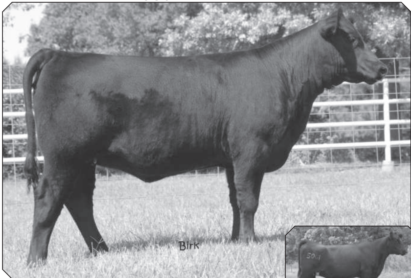
MCCURRY ELBA 9007 – She sells as Lot 1.