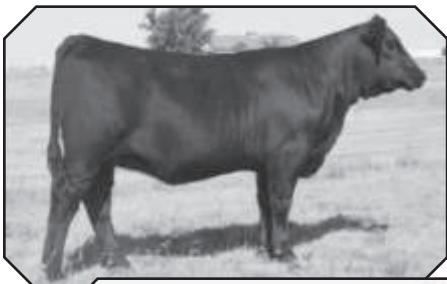
KTP MISS MAXIE 5214 4200 901 – She sells as Lot 18.

This direct daughter of SAV Net Worth 4200 stems back to the Pathfinder Sire DHD Traveler 6807, and a second generation Pathfinder Dam. This powerful young female reads with tremendous growth genetics and offers tremendous maternal with show ring and eye appeal. Here is a powerful January female you can't miss!