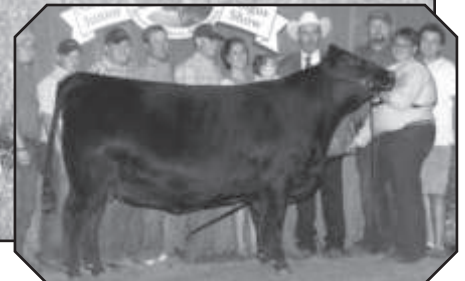
CHAMPION HILL SKYMERE 6379 – Reserve Grand Champion Female of the 2009 National Junior Angus Show whose dam is the full sister to the dam of Lot 14.