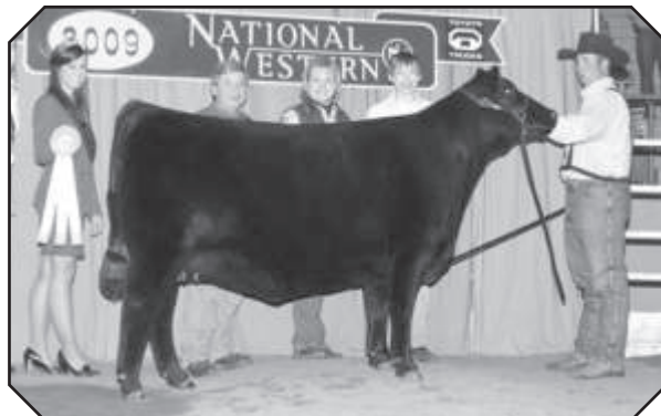
MCCURRY BLACKCAP 7028 – 2009 Reserve Junior Champion Female at the National Western Stock Show.