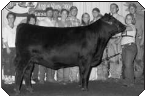
MARANDS MISS WIX 2301 - The 2004 Reserve Grand Champion Owned Female at the National Junior Angus Show.