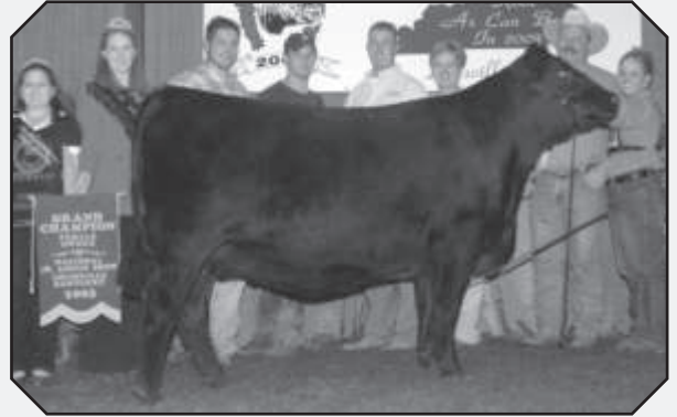
MARANDS ROYAL LADY 1037 – 2003 Grand Champion Owned Female at the National Junior Angus Show. She stems from the same family as Lots 26 through 28.