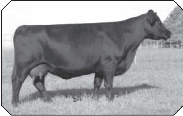
ERICA 0011 OF JJM – Dam of Lot 23.