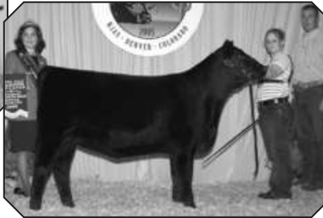
MARANDS ROYAL LADY 4056 - The 2005 Bred & Owned Senior Heifer Calf Champion at the National Junior Angus Show.