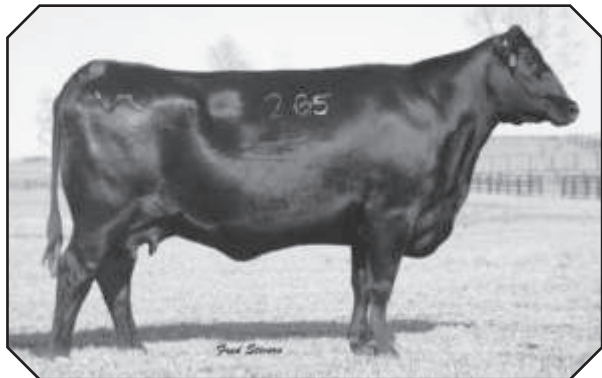
HYLINE PRIDE 265 – Dam of Hyline Right Time 338 and stems from the same family as Lots 33 and 33A.