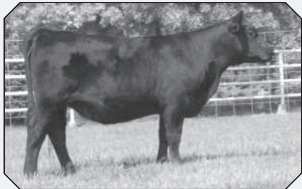
MCCURRY BLACKCAP 8098 – She sells as Lot 5.