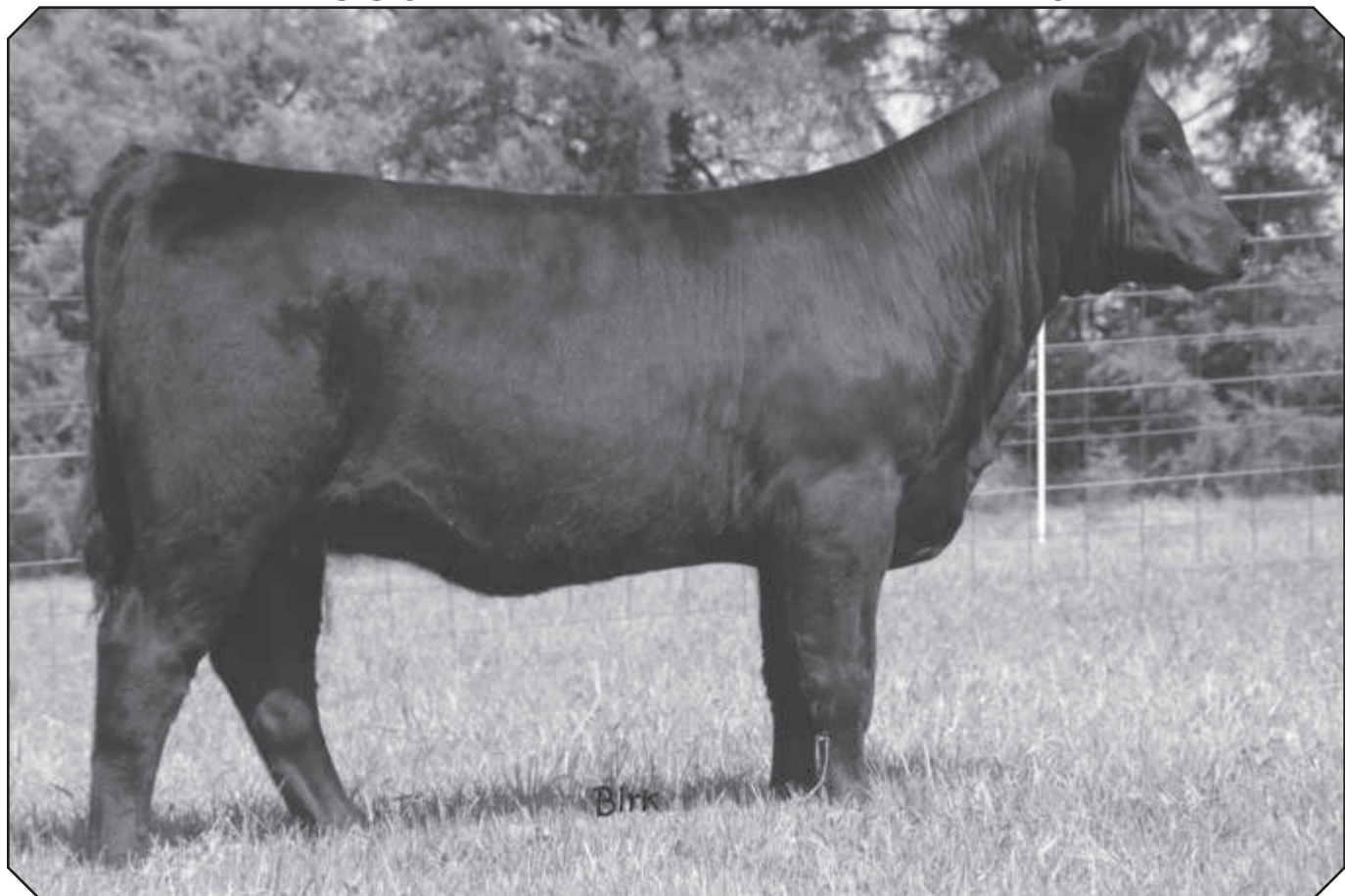
MCCURRY LADY 9026 – She sells as Lot 12.