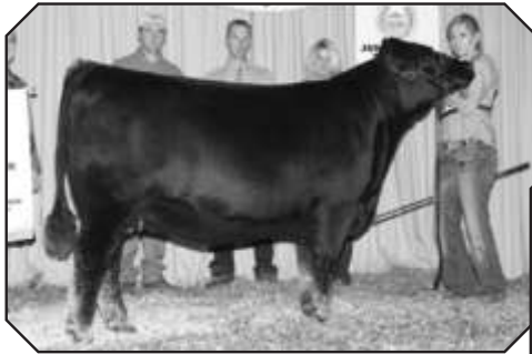
MARANDS MISS WIX 5038 - The 2007 Atlantic National Junior Show Reserve Grand Champion Owned Female. Division Three Heifer Calf Champion of the 2006 National Junior Angus Show. 2007 Reserve Senior Champion at the Atlantic National 2005 American Royal Grand Champion Female of the Junior Angus Show