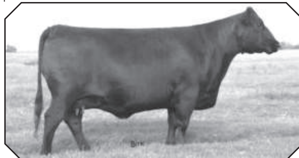
MARANDS MISS WIX 9945 – Maternal sister to the dam of Lot 9.

The dam of this female is a maternal sister to Marands Miss Wix 9945 who went on to produce the top-selling heifer calf pregnancy of the Inaugural McCurry Angus Ranch Female Sale for $10,000 along with producing the 2004 National Junior Angus Show Reserve Grand Champion Female, Marands Miss Wix 2301. Yet another maternal sib was the 2005 and 2006 Class Winner at the National Junior Angus Show, Marands Miss Wix 4059, who went on to be selected as the 2005 North American International Livestock Exposition Reserve Division Champion along with being selected as the 2005 American Royal Division Champion.