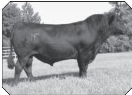
MARANDS M-W ASSASSIN 518 – Reference Sire A