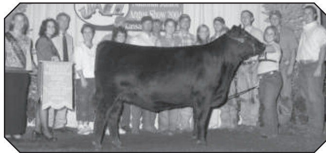
MARANDS MISS WIX 2301 – 2004 National Junior Angus Show Reserve Grand Champion Owned Female and dam of Lot 8.