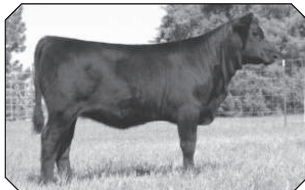
MCCURRY BELL 9020 – She sells as Lot 13.