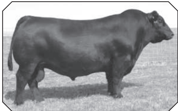
SAV NET WORTH 4200 – His influence sells.