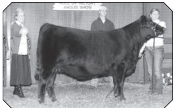
MCCURRY MISS WIX 6027 – 2007 NAILE Reserve Junior Yearling Female and stems from the same family as Lots 10 through 11B.

This powerful young female stems from the extremely productive family that has produced numerous champions throughout the McCurry program. Here is one that you can't miss!