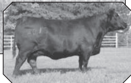
MARANDS BLACKCAP 3018 OF JJM – Dam of Lot 3.