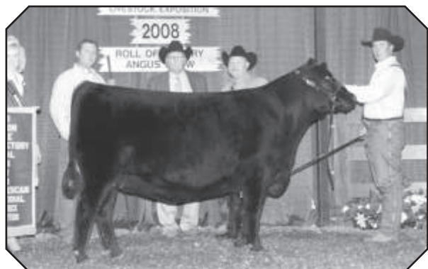
MCCURRY BLACKCAP 7018 – The 2008 North American International Livestock Exposition Grand Champion Female whose dam is a maternal sister to the dam of Lot 2.

This female's dam is a maternal sister to the dam of the top-selling female in the 2007 McCurry Angus Ranch Sale who then went on to be a reserve division winner at the 2009 National Western Stock Show, McCurry Blackcap 7028, selling for $15,000 to Alex Rogan of South Dakota along with the second top-selling female of the 2007 McCurry Angus Ranch Sale for $9,500 going to Tess Stickline of Kansas who then went on to be named the North American International Livestock Grand Champion Female and the Reserve Grand Champion Female at the 2009 National Western Stock Show Junior Show, McCurry Blackcap 7018.