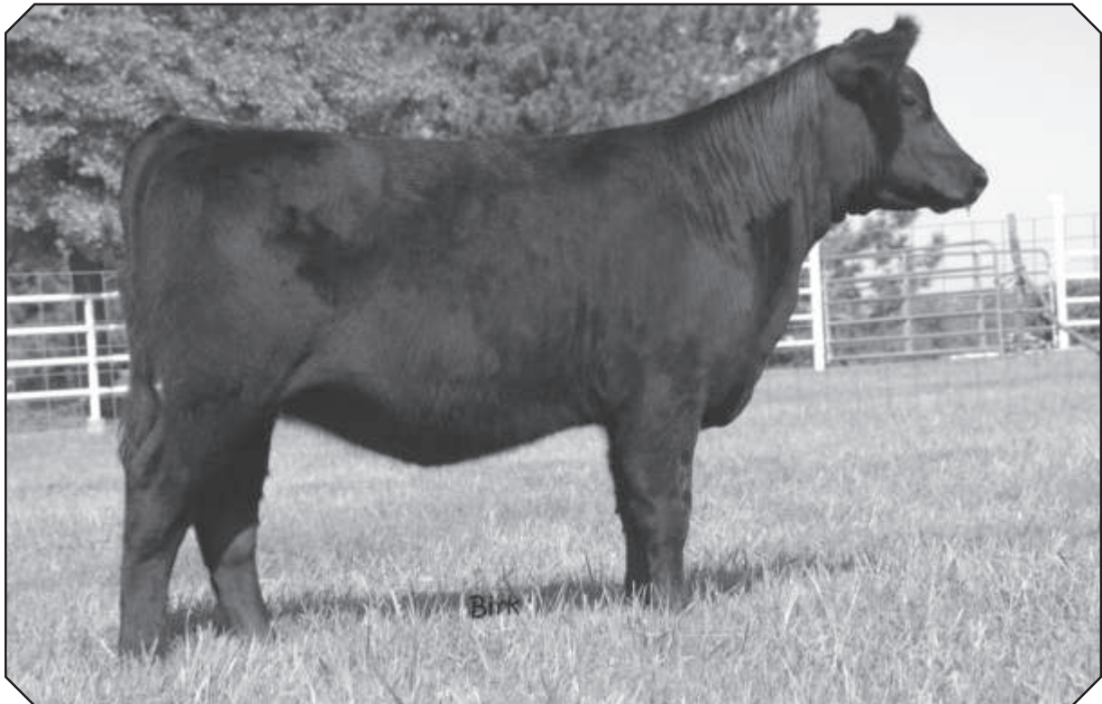
MCCURRY MISS WIX 9008 – She sells as Lot 10.