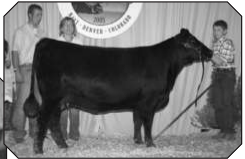
MARANDS BLACKCAPETTE 3053 - Reserve Senior Heifer Calf Champion at the 2005 National Junior Angus Show.