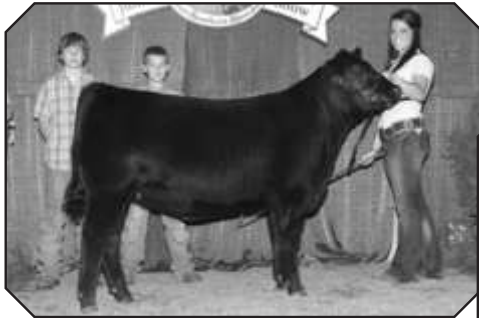
MAYWAY BLACKCAPETTE 840 - Late Senior Heifer Calf Champion whose dam was produced in the McCurry Angus Ranch program.