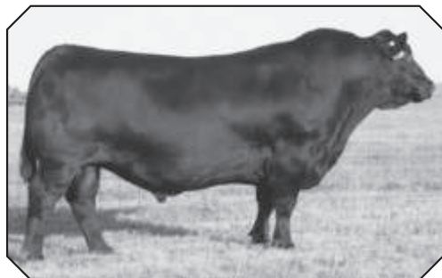
SAV 8180 TRAVELER 004 – Reference Sire B

SAV 8180 Traveler 004 is a legendary sire who will continue to impact the entire beef industry for years to come. As you flip through the sale book, you will see that many of the females are out of daughters of the great SAV 8180 Traveler 004 and his influence is felt throughout this grand event.