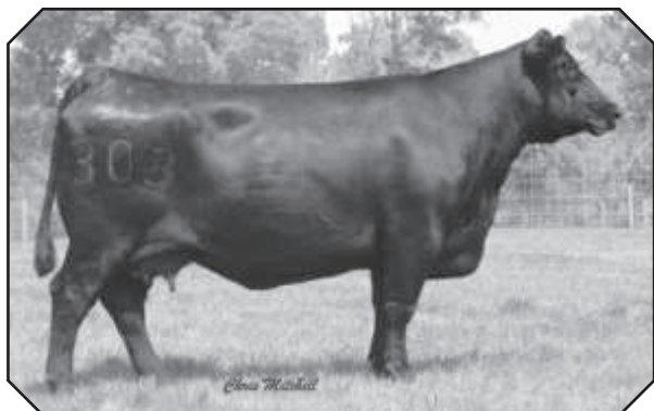
GAR PRECISION 303 – Grandam of Lot 35 and great-grandam of Lot 35A.

She stems from a dam that ranks below breed average for Birth Weight EPD while reading positive for carcass genetics with a progeny production record of BR 4@95, YR 3@101 and she stems from a grandam that records BR 3@96, WR 3@109, YR 3@101, U%IMF 63@101.