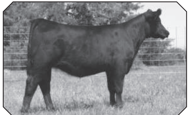
MCCURRY ABERDEEN PRIDE 9001 – She sells as Lot 16.

This featured January show heifer prospect by EXAR Lutton 1831 goes back to the proven Pathfinder leader, SAV 8180 Traveler 004, back to the Pathfinder Sire Bon View Emulation EXT 473, and the featured Aberdeen Pride family on the bottom side. This female stems from a dam that had an individual birth ratio of 90, U%IMF of 102 and stems from a grandam that has a progeny production record of BR 1@90, U%IMF 1@102 and UREA 1@128.