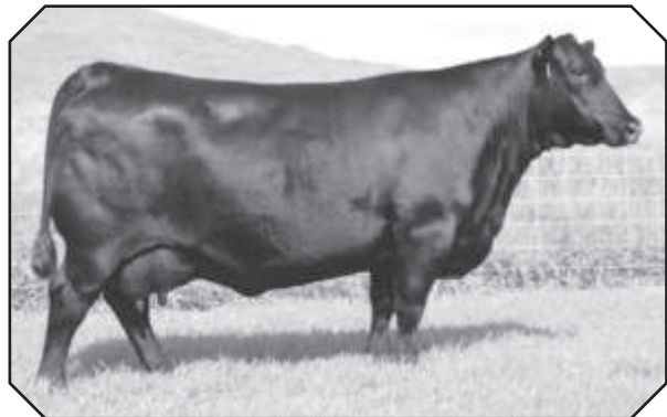
SAV ELBA 1094 – Full sister to the great-grandam of Lot 1.

This female offers unlimited genetic potential and is a "can't miss" sale attraction of the 2009 sale season.