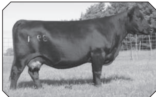
CHAMPION HILL LADY 3991 – Donor dam of Lot 12.

This female is a maternal sister to the $5,000 selection of the fourth top-selling heifer in the 2008 McCurry Angus Ranch Annual Production Sale. The same day a featured flush on Champion Hill Lady 3991 went on to sell for $5,000. This powerful young female has what it takes to compete at all levels.