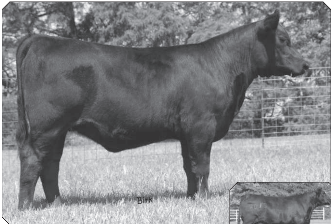
MCCURRY WAR BLACKCAP 9006 – She sells as Lot 3.