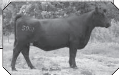
SAV SR ELBA 5001 – Dam of Lot 1.