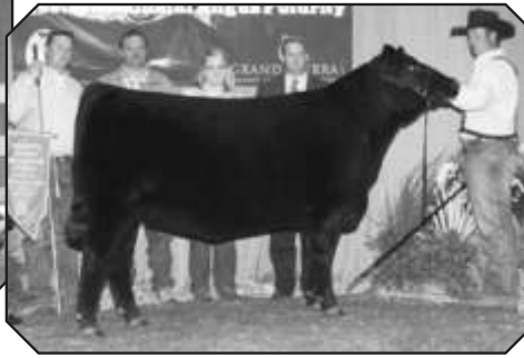
DUCK RIVER BLACKCAP 714 - Reserve Grand Champion Female at the 2009 Western National Angus Futurity, Reno, Nevada, Grand Champion Bred and Owned Female of the 2009 Central Regional Show, Reserve Grand Champion Bred and Owned Female at the National Western Stock Show, Reserve Senior Heifer Calf Champion at the National Western Stock Show.