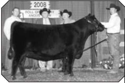
MCCURRY BLACKCAP 7018 - Grand Champion Female of the 2008 North American International Livestock Exposition, Reserve Grand Champion Female at the National Western Stock Show Junior Show and Reserve Junior Yearling Female at the 2008 American Royal.