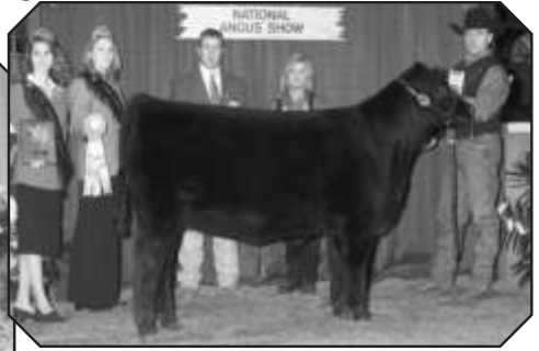
MARANDS MISS WIX 1071 - Senior Heifer Calf of the Year.