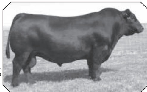
SAV NET WORTH 4200 – Reference Sire D

Net Worth is the most unique and powerful Angus bull in the world and a major force in the future of the Angus breed. His progeny will be offered throughout this sale.