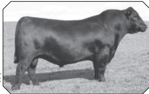
SAV BISMARCK 5682 – Reference Sire C