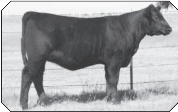
KTP MISS JOANIE5242 4200 905 –She sells as Lot 17.