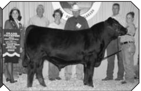
MARANDS ALL IN 4010 - Grand Champion Bred & Owned Bull of the 2005 National Junior Angus Show.