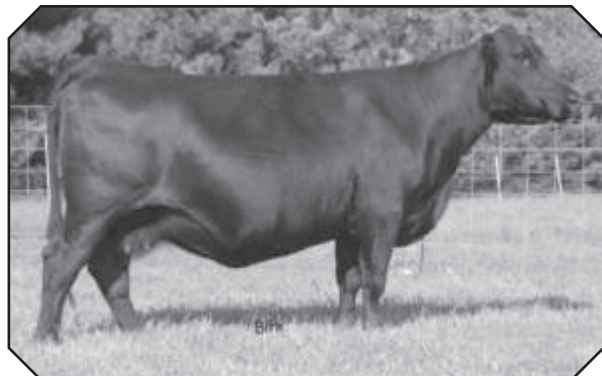
BLACKCAP 9852 OF JJM – Grandam of Lot 3.

This special female by Pathfinder Sire SAV 8180 Traveler 004, stems back to the ten-time All-American Sire of the Year, Leachman Saughatchee 3000C. She is a powerful young female that reads with outstanding growth genetics without sacrificing carcass and maternal traits. She has tremendous eye appeal and offers unlimited genetic potential and stems from the same family that went on to produce the 2008 North American International Livestock Grand Champion Female, McCurry Blackcap 7018.